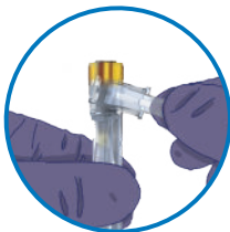
TILT LEFT OR RIGHT