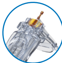
GET THE SCREW