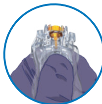
PUSH THE SLIDER